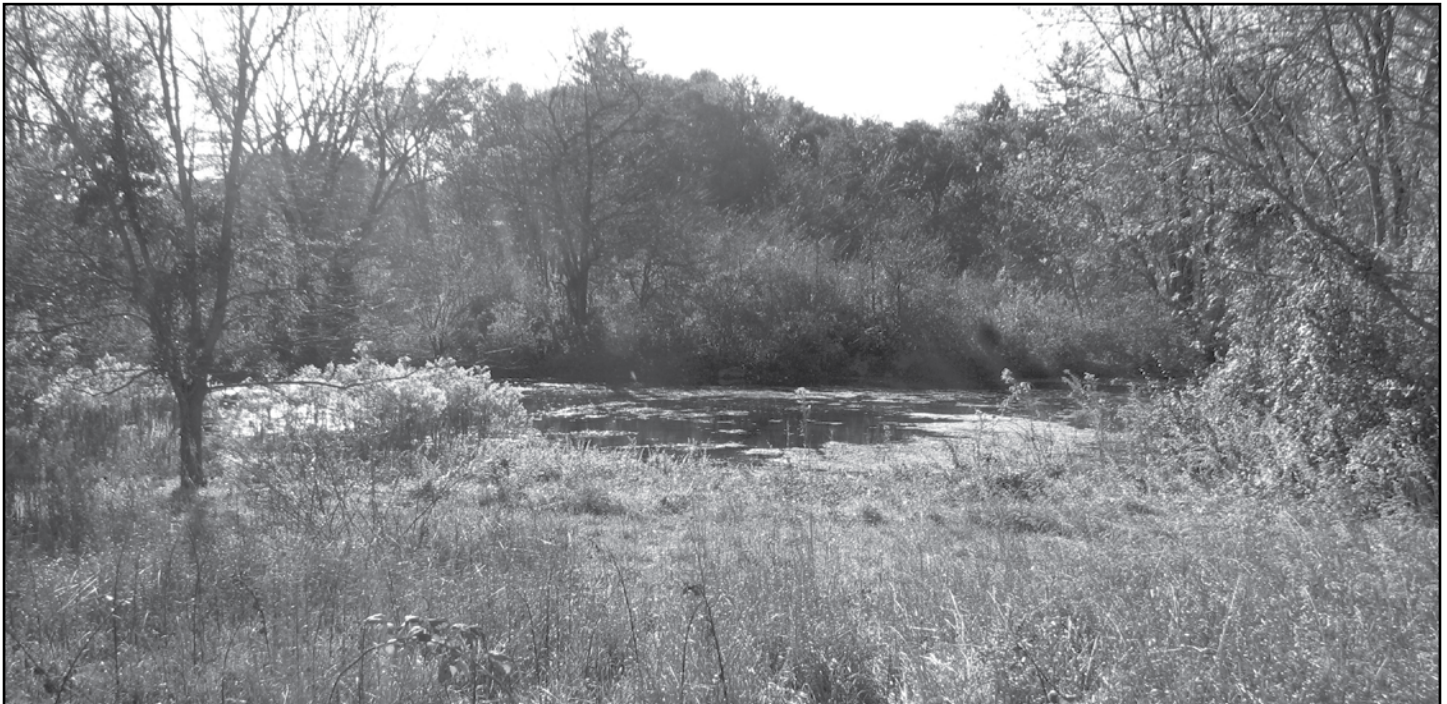
Headwaters of Elk Branch Creek is located in the 135 acres of orchard in Jefferson County placed under easement by the Twin Ridge Orchard Company, Inc.

The Land Trust of the Eastern Panhandle joined with the Jefferson County Farmland Protection Board this spring of 2011 to complete four conservation easements.