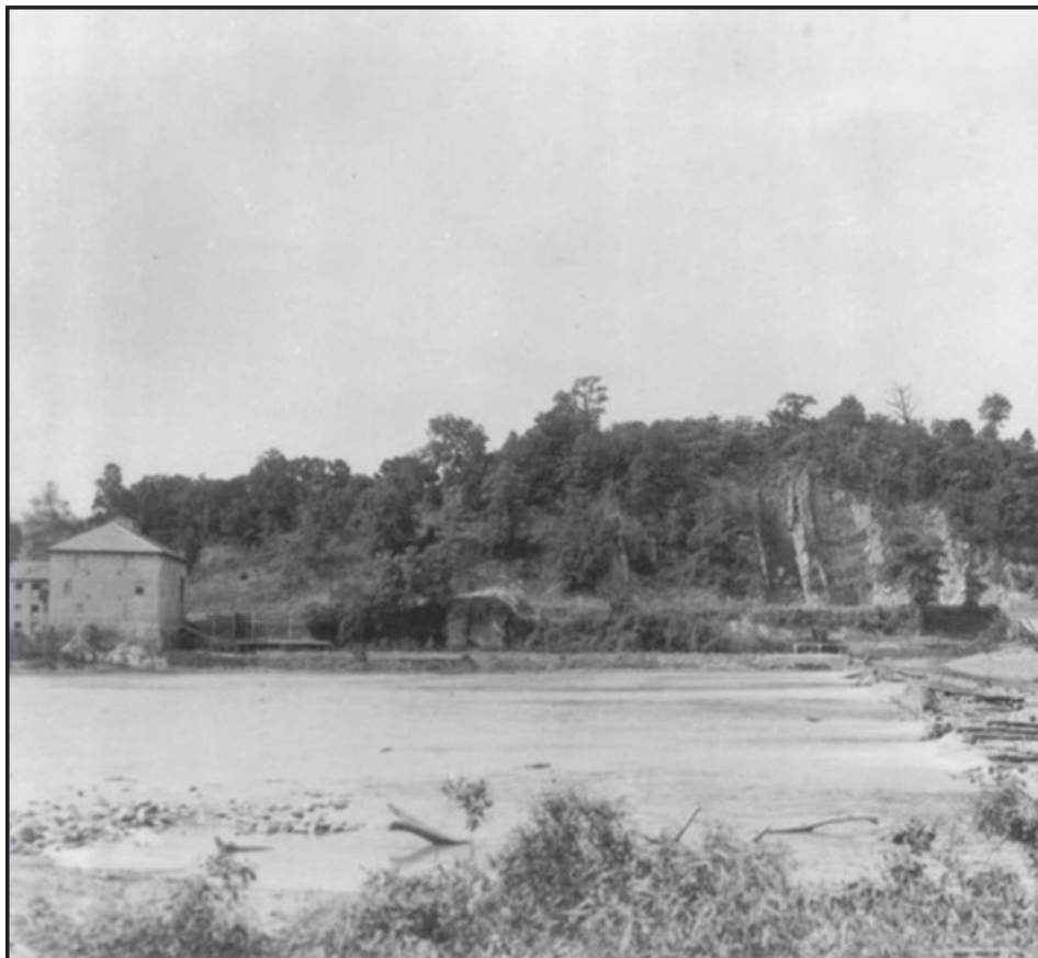
The Cement Mill in an 1890's photo taken from the Maryland Shore.

This year, the Cement Mill property is being expanded by addition of two small parcels on Trough Road at its intersection with River Road. Both parcels have houses on them marked for demolition, which will result in protection of an