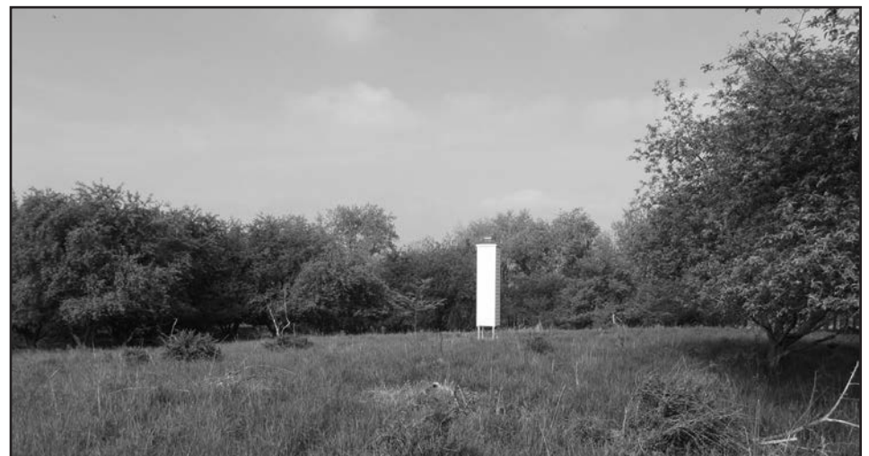
Chimney Swift Tower constructed in the apple orchard on the Conservation Easement of the Claymont Society for Continuous Education. The tower provides potential nesting sites for Chimney Swifts, replacing the chimneys of the Claymont Court Mansion.